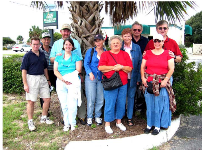
Most of IOP Connector Run Communications Crew