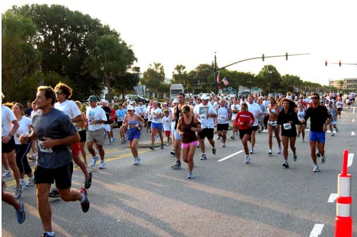
IOP Connector Run