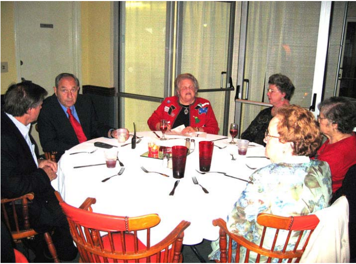
Christmas Party Pictures