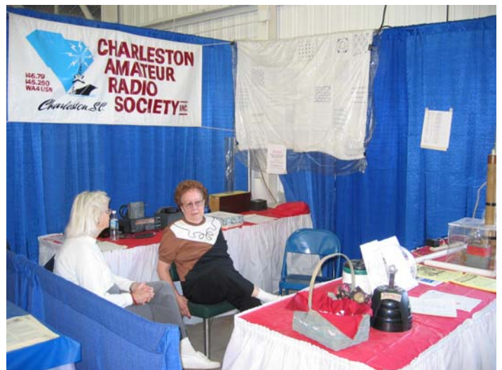
CARS booth at Coastal Carolina Fair