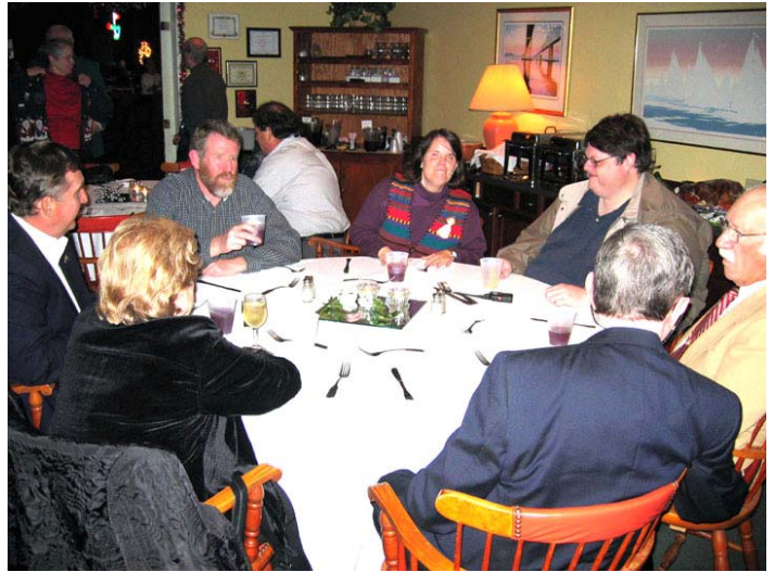
Christmas Party Pictures