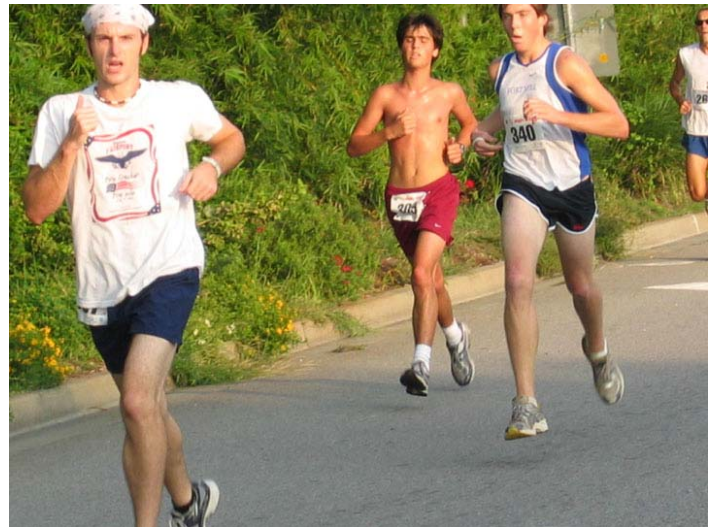
IOP Connector Run

Visit the ARRL Web site for full information on Kids Day http://www.arrl.org/FandES/ead/kd-rules.html .