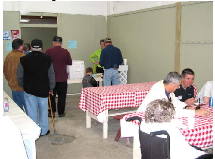
It's time to take a break from the Hamfest activities and sample some of the CARS Barbecue.