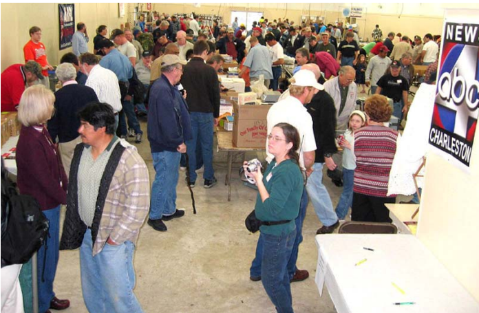
Part of the Hamfest crowd.