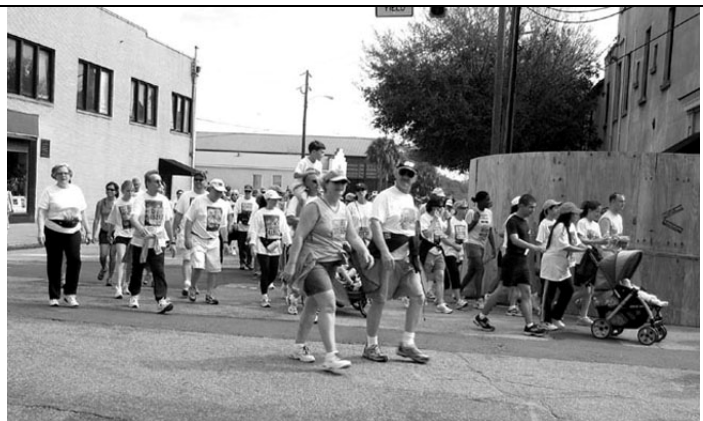
Cooper River Bridge Run Pictures