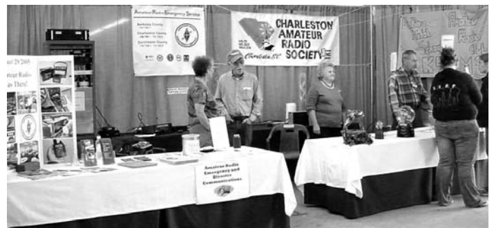
CARS booth at 2006 Coastal Carolina Fair Color photos of the CARS Fair booth and the IOP Connector run are on the CARS Web Site “Club Event Photos” page at www.wa4usn.org